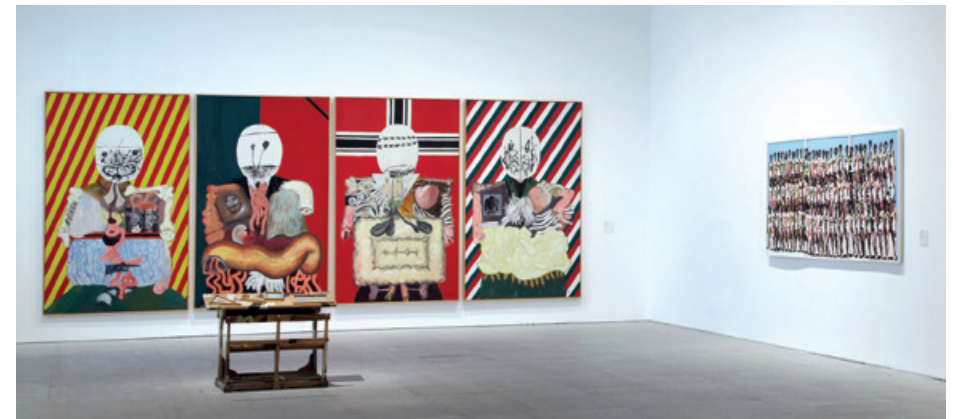
Museo Reina Sofía Collection, view of exhibit: The Critical Image. Figuration in 1960s Spain