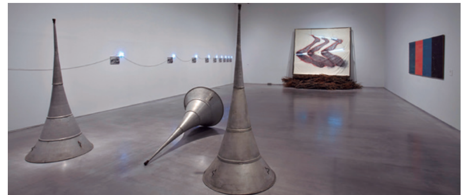
Museo Reina Sofía Collection, view of exhibit: Living Spaces: the Politics of Arte Povera