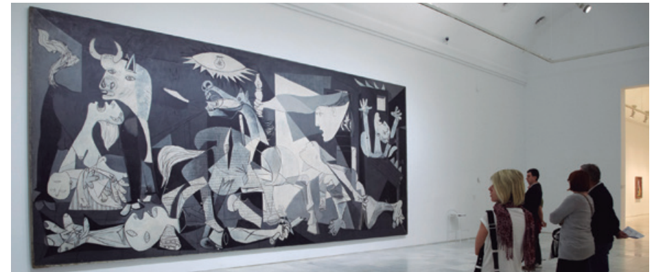
Museo Reina Sofía Collection, view of exhibit: Guernica and the 1930s