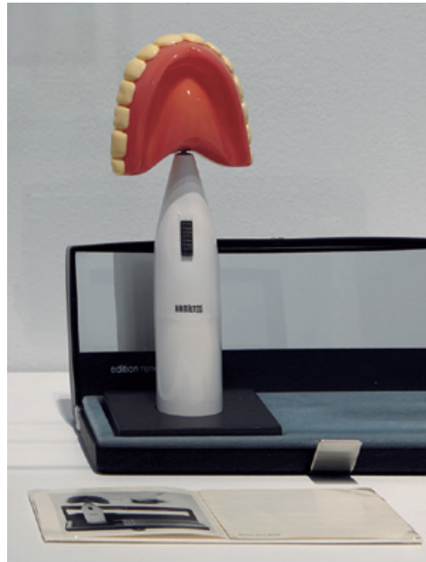
Image of the exhibition Richard Hamilton Museo Reina Sofía, 2014