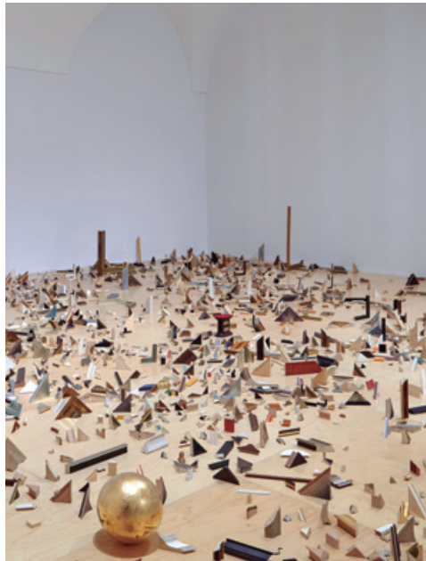
Image of the exhibition Juan Luis Moraza, Republic Museo Reina Sofía, 2014

shows, both retrospective and specifically focused, on artists of recognized prestige who have a special significance within the Museum's collections; historical, thematic and thesis exhibitions which confront the work of various artists, examining particular moments and occasionally feeling the pulse of what is happening today; and newly produced projects within the framework of the Fissures Program and the Palacio de Cristal, which support the materialization of new work by internationally renowned artists. In the case of the Palacio de Cristal, the artists confront the challenge of producing a specific intervention for this unique space.